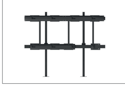
No fine adjustment necessary