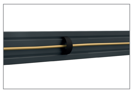
Cable routing with clips

In addition to the pre-configured systems, HAGOR offers customised special solutions in the LED sector, which can be individualised with accessories such as loudspeakers, controls and so on to meet all requirements.