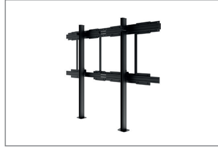
Low space requirement thanks to floor-wall mounting

Technical changes reserved | This document is the property of HAGOR Products GmbH. Forwarding and duplication of this document, utilization and communication of its contents are not permitted unless expressly permitted. A violation obliges you to pay compensation. All rights reserved in the event of a patent, utility model or design registration.